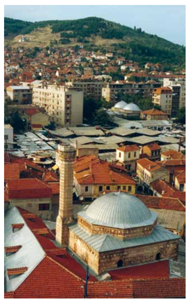
Fig. 5, Haci Bey mosque in 2000

space between the drum and the squinch tops, a construction element used again in the Yeni mosque of 1558-59, and the mosque of Haydar Kadı of 1561-62. The basic building material is the ancient Byzantine technique of picturesque alternation of three layers of bricks and cut stone as well as inserting brick between cut stone in the "Cloisonné" manner. The wall thickness is between 1.65–2.10 m. on the Qible wall. The base of the prayer hall is a square with dimensions 14.55 x 14.55 m. and the wall thickness of 1.63-183m.<sup>29</sup> The interior is illuminated by three rows of windows of which the lowest ones are monumentally framed by marble, and have massive grilles and casement shutters. The fragments of red and green stained glass in stucco frames are remnants of the past glory of the building.<sup>30</sup> The mosque has a double portico made up of an atypical shed roof lean to the prayer hall, covering the two rows of six domed arcades, dividing the space into ten bays. An archaic decoration of the capitals with 'Turkish triangles' indicates that this portico once opened in three domed arcades. For