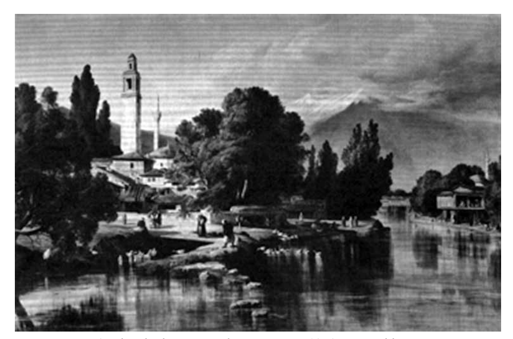
Fig. 9, The clock tower and a mosque in 1848, painted by E Lear

duced into the mosque complex and it was renovated five times.<sup>75</sup>