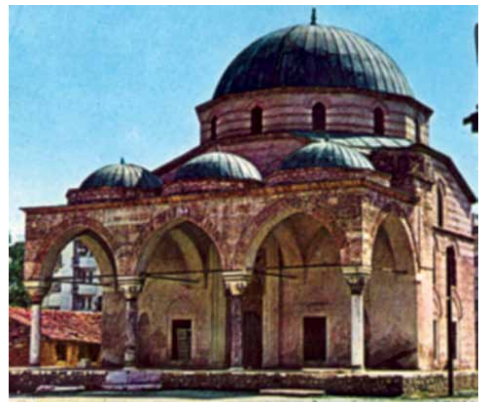
Fig. 8, Haydar Kadi mosque, old post card

Access to the mahvill balcony is through the minaret entrance and a short tunnel, which goes horizontally throughout the inner qibla wall, above the entrance. The entrance that communicates between the prayer hall and the porch has wooden panel doorways with carved octagonal rosettes. They contain a Koranic inscription, which comes from the 112th Surrah Al-Ikhlas written with calligraphic Celi Nesih letters:<sup>67</sup> In the name of God, the most Gracious, the dispenser of Grace Say: 'He is one God, God the Eternal, the Uncaused cause of All Being He begets not, and neither is He begotten and there is nothing That could be compared with Him.' Faience decoration of Iznik origin frames the main portal, which has the wooden balcony, carved walnut doors and a glazed ceramic plaque above. The faience plates measure 25 x 25.5 cm. and are decorated in a Cobalt-turquoise color on a white background, as is characteristic of Iznik underglaze tiles of the 16th century and it can be found in the mosque at Komotini in Greece.<sup>68</sup> This is the only ceramic decoration amongst the mosques in Bitola. The interior of the dome, the stalactite squinches, the