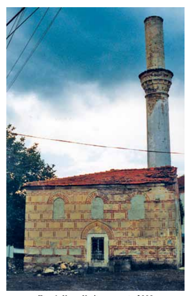
Fig. 6. Koca Kadi mosque in 2000

1663. The mosque was also noted in the Land Survey register dating from 1141 AH/ 1728.36 The founder of the mosque and its complex was Haci Mahmud Bey, known in the town as 'Tomruk Aga' (The prison warder). He may have been one of the war heroes (Gazi) of Sultan Bayezit Han and for that reason he was appointed as governor of the town, which he ruled in a despotic manner. In the oldest parts of the Carşı (market), next to the river, he erected his pious mosque with its complex. For the maintenance of the complex he endowed a generous Vakıf of 300,000 bags of aspres (each bag contained 500 aspres), ten shops and ten houses.<sup>37</sup> In this vakif were included the revenues from the two neighboring villages of Bukovo and Orehovo, then nine shops and two hamams in Berat and Iskenderiye in today's Albania. 38 (Fig. 5, Haci Bey mosque in 2000)