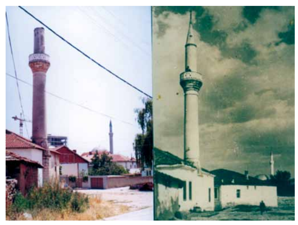
Fig. 2, Isa Fakih mosque, situations in 2001 and in 1943

Such an unusual use of the apse is a probable result of mutual influences of Byzantine and Ottoman architecture, which had its beginnings in the 14th century. Some of the poorer quarters' mosques had rectangular bases and were covered by a hipped roof and terracotta tiles, for example, the Koca Kadi cami of 1529. Above the main entrance the wooden balcony (Mahvill mükebbire) was constructed, serving as a platform for the muezzin's service, or later for distinguish ladies. Opposite, on the Qible wall, towards Mecca, was the niche, or Mihrab, decorated with geometric stalactites. The mosques of Ishakkye, Yeni and Haydar Kadi had richly elaborated Mihrab ornamentation. On the right side of the prayer hall was a Minber, a wooden dais reached by a tall staircase and decorated with geometrical motifs. On the left, next to the wall was the Qursu, a high chair for the local imam when teaching. The Ishak Çelebi mosque had a circular gallery inside the drum of the dome locally called 'Donanma' used for maintenance purposes; this is a unique case among Bitola's mosques.<sup>7</sup> On the right of the prayer hall was the spot where the solidly built minaret with a decorated balcony was located. The Selcuk decorated minaret of the Sungur Cavuş mosque was an exception, for it was on the left side of the prayer hall, mounted on the wall. The two bases for minarets, which rose on either side of