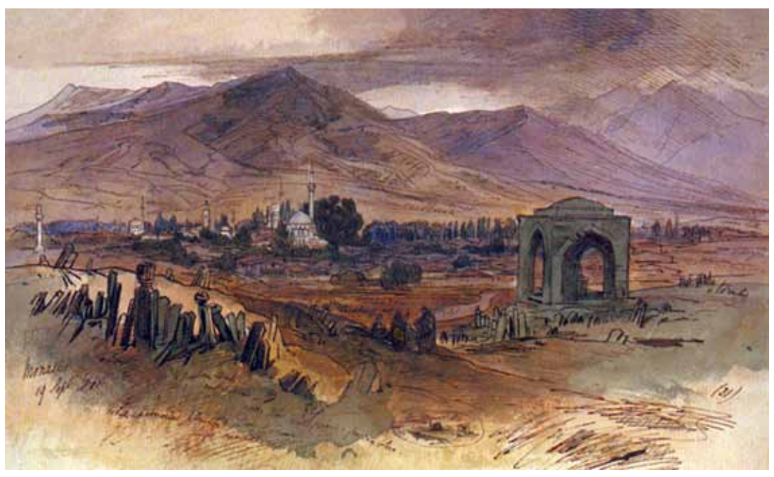
Fig. 1. Panorama of the city of Manastır, painted by Edward Lear in 1848. On the right side is the Kızlar Bey turbe, in the centre is the mosque of Haydar Kadi with its original minaret, to the left are the mosques of Sungur Bey and Ishakkiye, further to the left is the Sahat Kule (Clock tower) and the Yeni mosque.

The town of Manastir is a large city situated on the lower slopes of a mountain, on the left and on the right sides of the river, which are connected by ten wooden or stone bridges. The town is full of greenery, adorned with a thousand huge trees from which it is hard to see it, until you reach it. The town is divided into twenty-one districts (mahalle) and its houses are built out of solid material and covered by tiles.