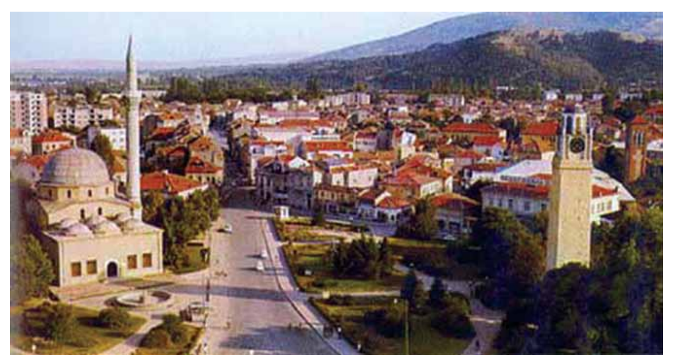
Fig. 7, Yeni mosque and Clock Tower